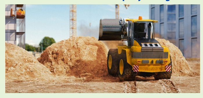
May 2, 2023 - Valley/Roanoke

A representative from Faulconer Construction will be at the Virginia Career Works to discuss open positions.