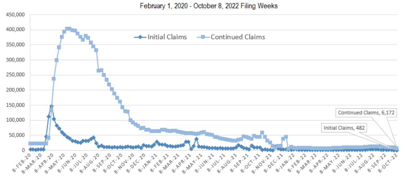
Virginia Weekly Unemployment Insurance Claims Activity